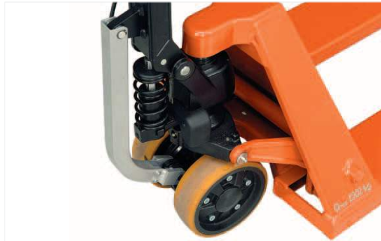
The BT Pro Lifter's steering arm provides leverage to the wheels to help get the truck moving