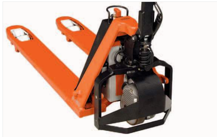
The LHT100's motor and battery are compact enough for it to be as manoeuvrable as a standard BT Lifter