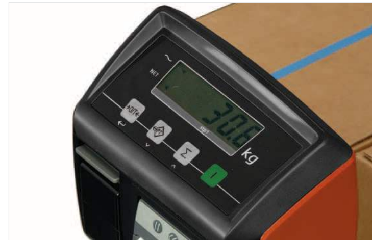
Weighing the load as part of the normal handling process increases productivity