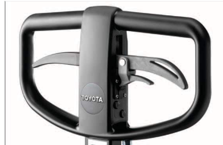
This is engaged by the manual control lever on the handle