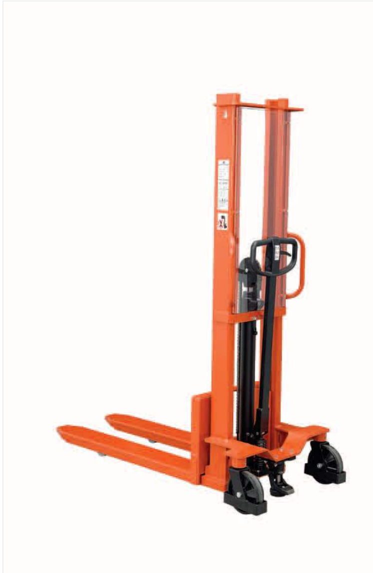
SHM080 manual version