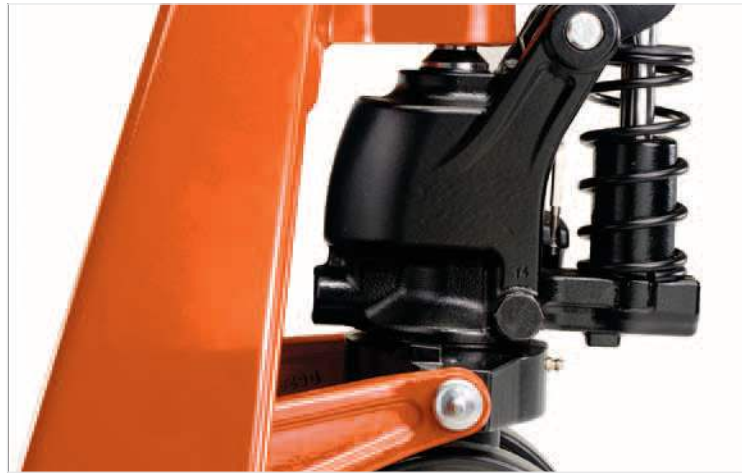
Strong adjustable valve rod and twin ball bearings