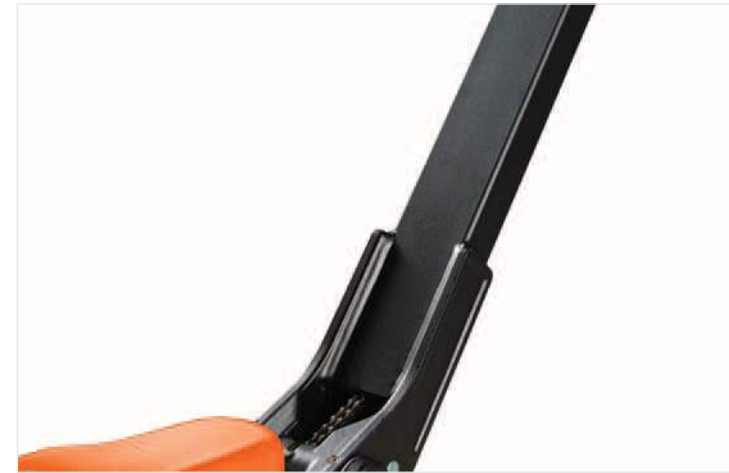
Robust robot-welded tow bar