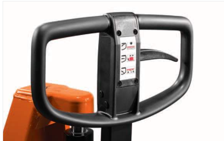
Comfortable enclosed handle