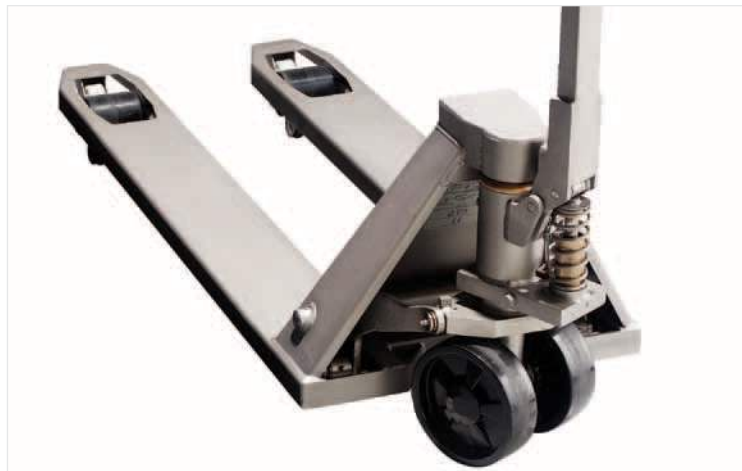
Stainless steel LHM200ST designed for corrosive environments