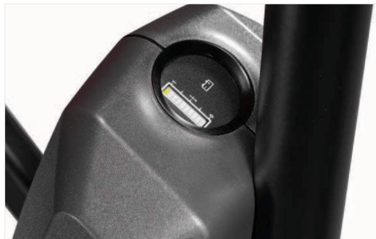
Battery indicator (HHL100)